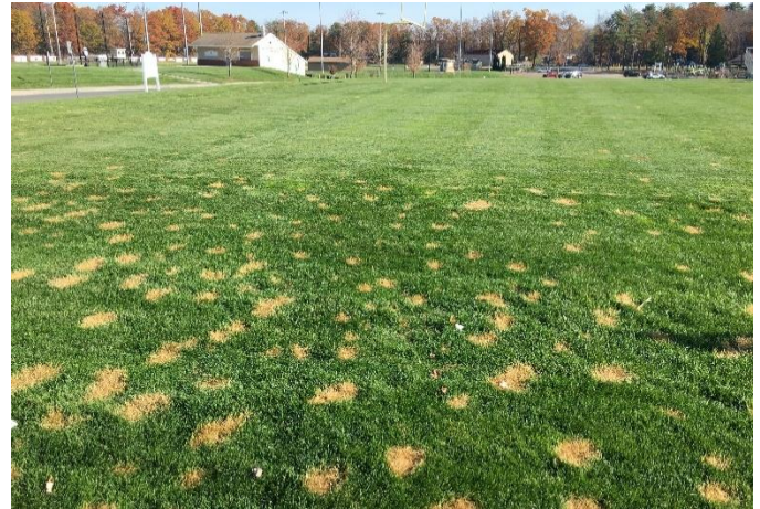
Figure 1. Chilling injury appears as tan patches of blighted turf uniformly distributed across athletic field.

The recent injury to turfgrasses throughout the region is likely due to a unique combination of environmental conditions impacting the physiological activity of turfgrasses. Cold tolerance of cool-season turfgrasses generally develops during November and December over an acclimation period of slowly decreasing temperatures. This acclimation period prepares turf to tolerate cold winter temperatures. However, turf has been actively growing, green, and photosynthesizing in many areas throughout the region this fall, indicating it has not yet acclimated to cold temperatures.