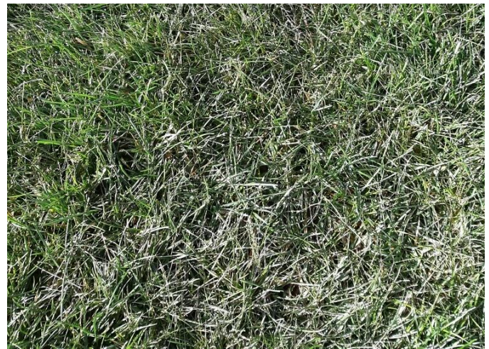
Figure 2. Silver-gray to purple foliage are initial symptoms of chilling injury.