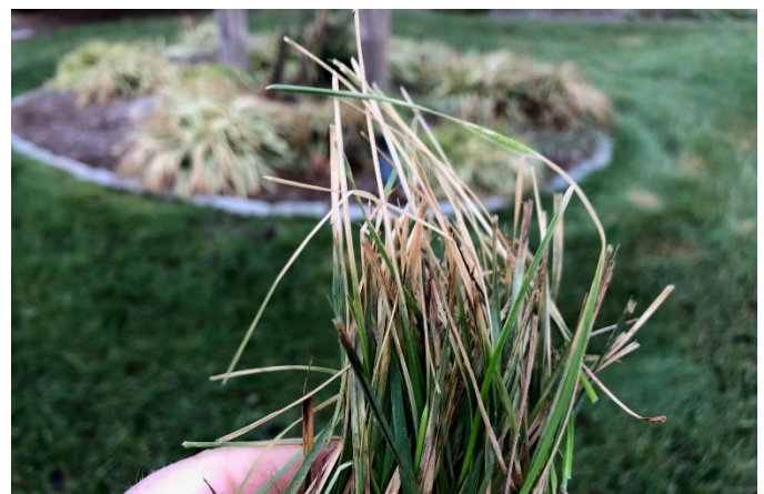
Figure 3. Injury only affected upper turf canopy (photo S. Bousquet)