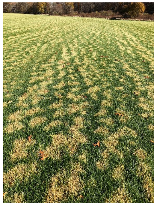
Figure 5. Patches of blighted turf coalescing into larger irregular shapes on a sod farm in RI.